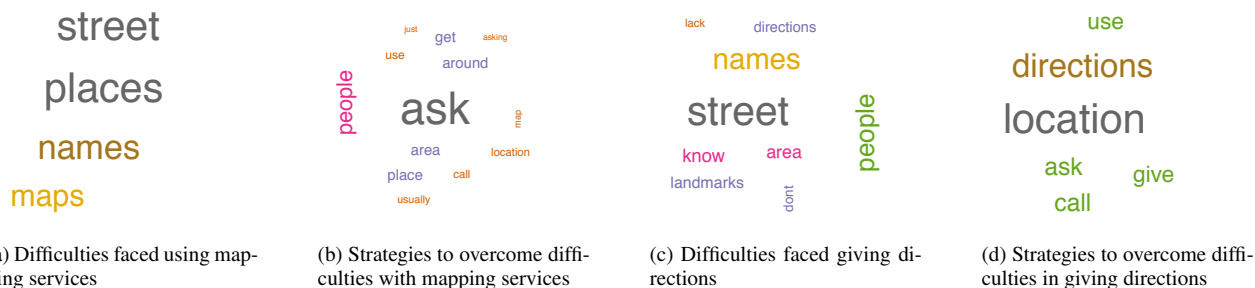
Figure 3: Word cloud visualizations of respondents' open ended responses.