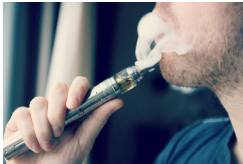
(b) Grasp B