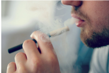
(a) Grasp A