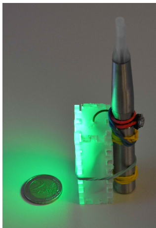
Figure 3: Our early VapeTracker prototype (attached to the Joyetech ® eGo-C e-cigarette) emitting green ambient light, placed next to a €2 coin for size comparison.